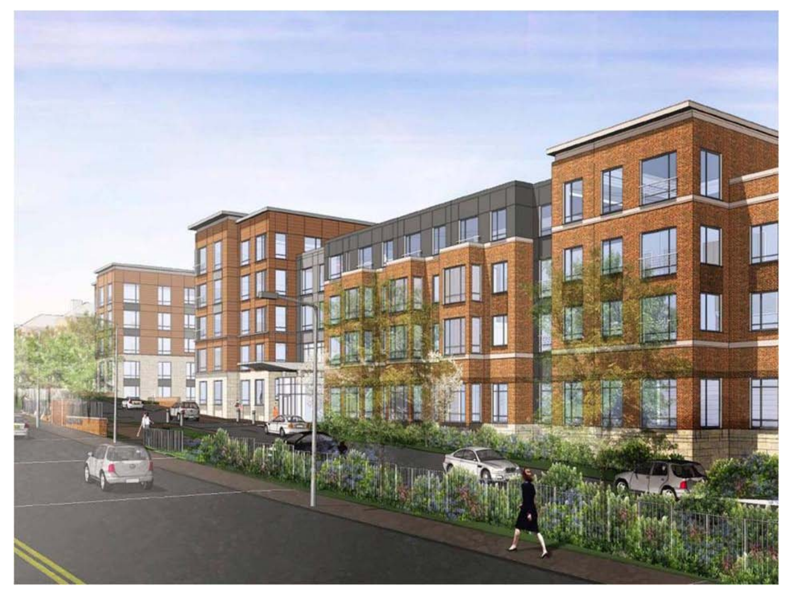
BOSTON REDEVELOPMENT AUTHORITY